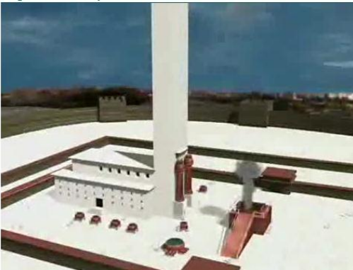
King Solomon's Temple 5 Minute Visual